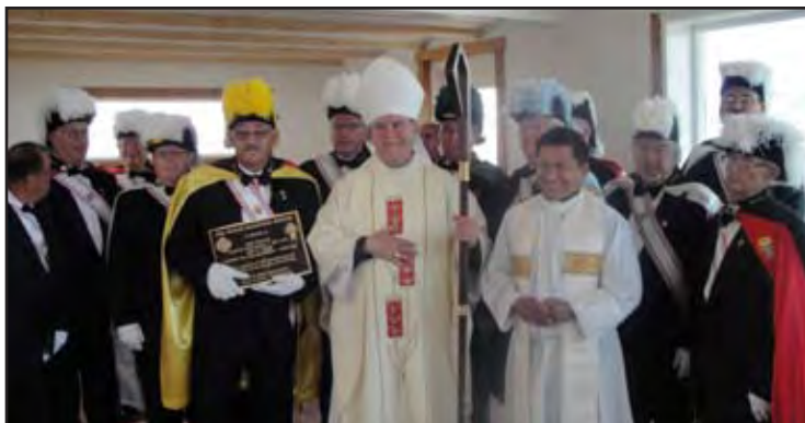
4th Degree Honor Guard present at dedication of Paul Fassler Memorial