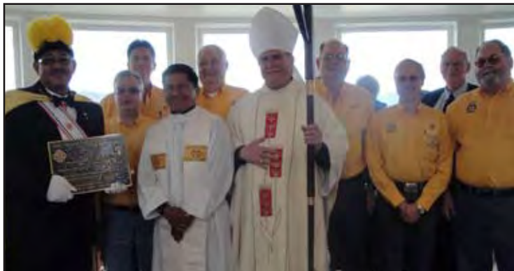
State Officers join Bishop Isern and Father Cisneros at dedication of Paul Fassler Building at San Luis Stations of the Cross