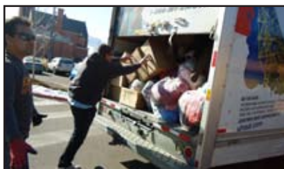
Keeping everything in the truck was challenging at times.